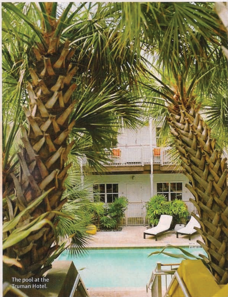
The pool at the Truman Hotel.