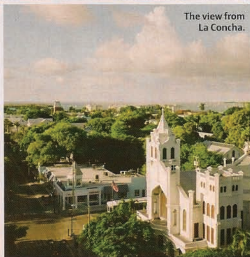
The view from La Concha.